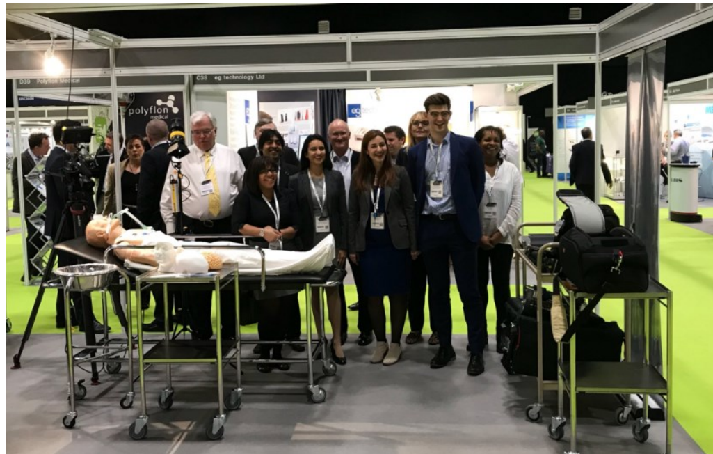
Members of the NIHR Trauma MIC, and MD-TEC teams